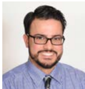
State Senator Omar Aquino

http://quigleyforms.house.gov/forms/writeyourrep/