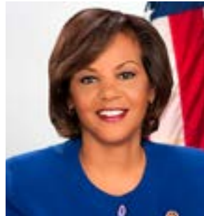
U.S. Representative Robin Kelly

https://www.duckworth.senate.gov/content/contact-senator