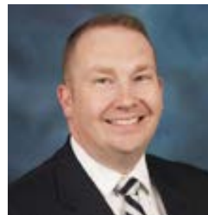
State Senator Scott Bennett

http://shimkus.house.gov/contact/email-me