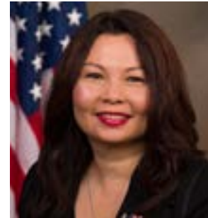
U.S. Senator Tammy Duckworth

http://www.durbin.senate.gov/contact/email