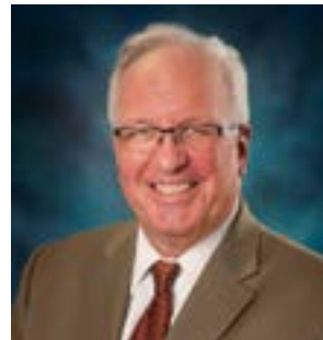
State Senator Pat McGuire

https://foster.house.gov/contact/email-me