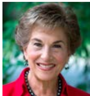
U.S. Representative Jan Schakowsky

https://www.duckworth.senate.gov/content/contact-senator