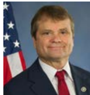
Saint Mary Campus: U.S. Representative Mike Quigley

http://gutierrezforms.house.gov/contact/