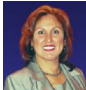
State Representative Cynthia Soto

http://www.ilga.gov/senate/Senator.asp?MemberID=2474