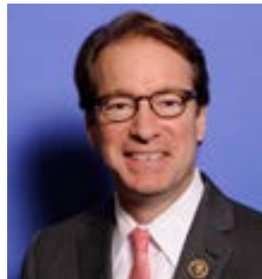
U.S. Representative Peter Roskam

https://www.duckworth.senate.gov/content/contact-senator