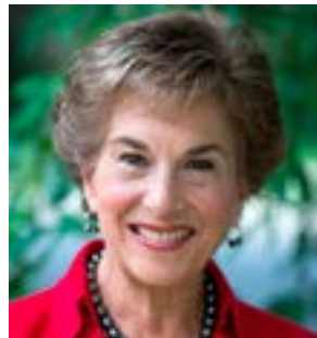
U.S. Representative Jan Schakowsky

https://www.duckworth.senate.gov/content/contact-senator