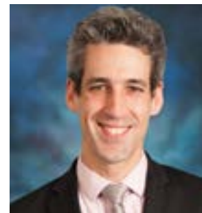
State Senator Daniel Biss

3706 Dempster Street Skokie, IL 60076 847.568.1250