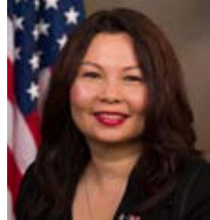
U.S. Senator Tammy Duckworth

http://www.durbin.senate.gov/contact/email