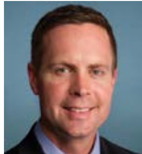
U.S. Representative Rodney Davis

https://www.duckworth.senate.gov/content/contact-senator