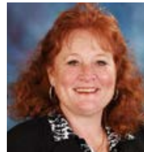
State Senator Laura Murphy

1510 Midway Court, Suite E.107 Elk Grove Village, IL 60007 847.718.1110