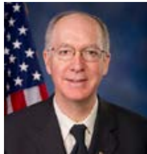
U.S. Representative Bill Foster

https://www.duckworth.senate.gov/content/contact-senator