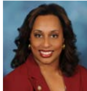
State Senator Toi Hutchinson

222 Vollmer Road, Suite 2C Chicago Heights, IL 60411 708.756.0882