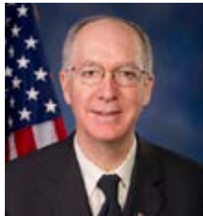
U.S. Representative Bill Foster

https://www.duckworth.senate.gov/content/contact-senator