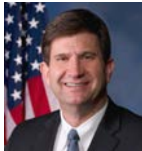
U.S. Representative Brad Schneider

https://www.duckworth.senate.gov/content/contact-senator