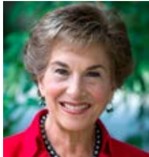
U.S. Representative Jan Schakowsky

https://www.duckworth.senate.gov/content/contact-senator