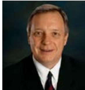
U.S. Senator Dick Durbin

711 Hart Senate Office Building Washington, DC 20510 202.224.2152