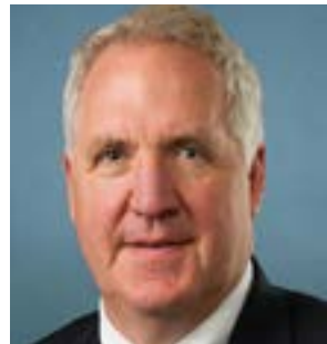
U.S. Representative John Shimkus

https://www.duckworth.senate.gov/content/contact-senator