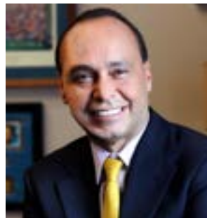
Saint Elizabeth Campus: U.S. Representative Luis Gutierrez

https://www.duckworth.senate.gov/content/contact-senator