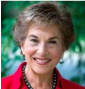
U.S. Representative Jan Schakowsky

https://www.duckworth.senate.gov/content/contact-senator